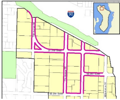
Figure 2— Area of Required Retail, Restaurant or Personal Services Use Along Ground Floor Street Frontages

"Setbacks. a. 78th Avenue SE. All structures shall be set back so that space is provided for at least 15 feet of sidewalk between the structure and the face of the street curb, excluding locations where the curblines is interrupted by parking pockets. Additional setbacks are encouraged to provide space for more pedestrian-oriented activities and to accommodate street trees and parking pockets"